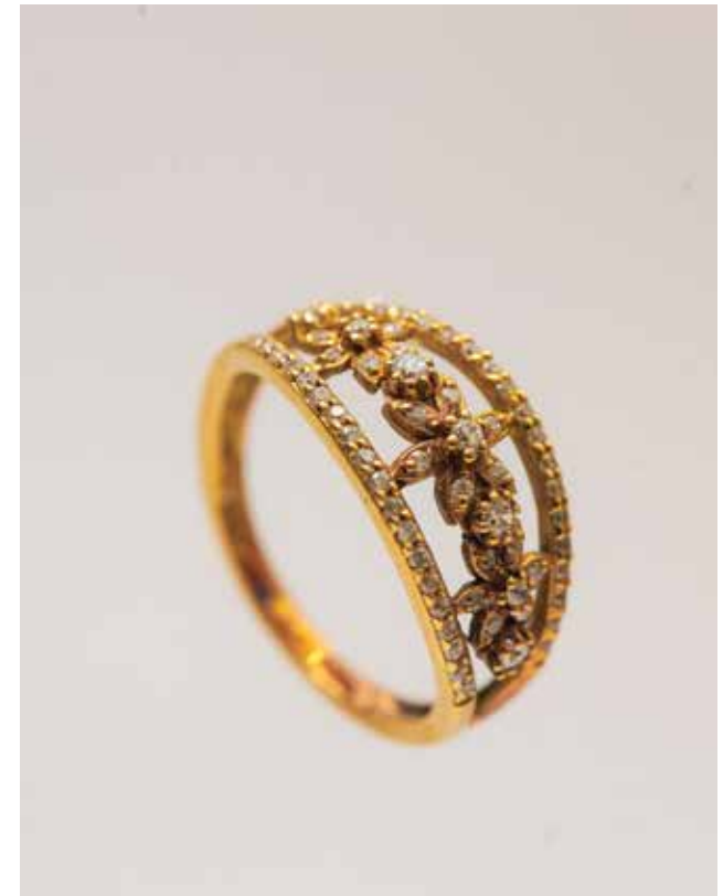
Three Star Ring