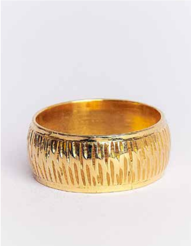
D-Shaped Back of a Tree with Edge