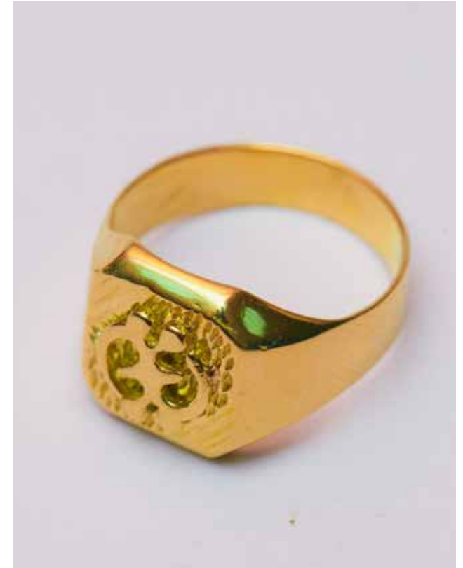
Embossed Gye Nyame on a Plate