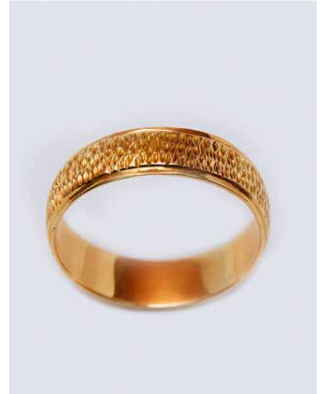
Back of a Tree Wedding Band