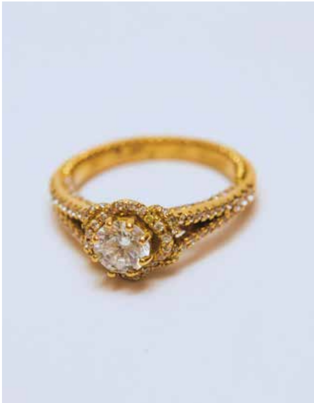
V Side Ring