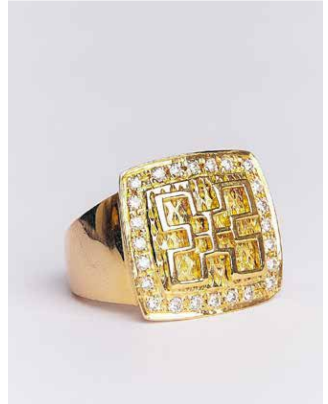
Nsaa with Diamonds

Karat: 18 | Weight: 13 grams Price range: Gh¢19,916 - Gh¢21,916