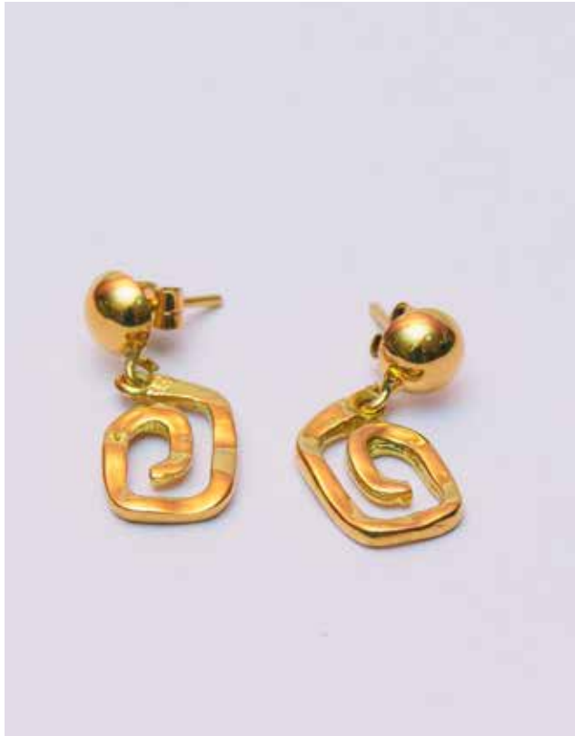
Stud Dangling Earring