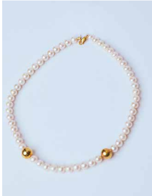
Fresh Water Pearls Bracelet