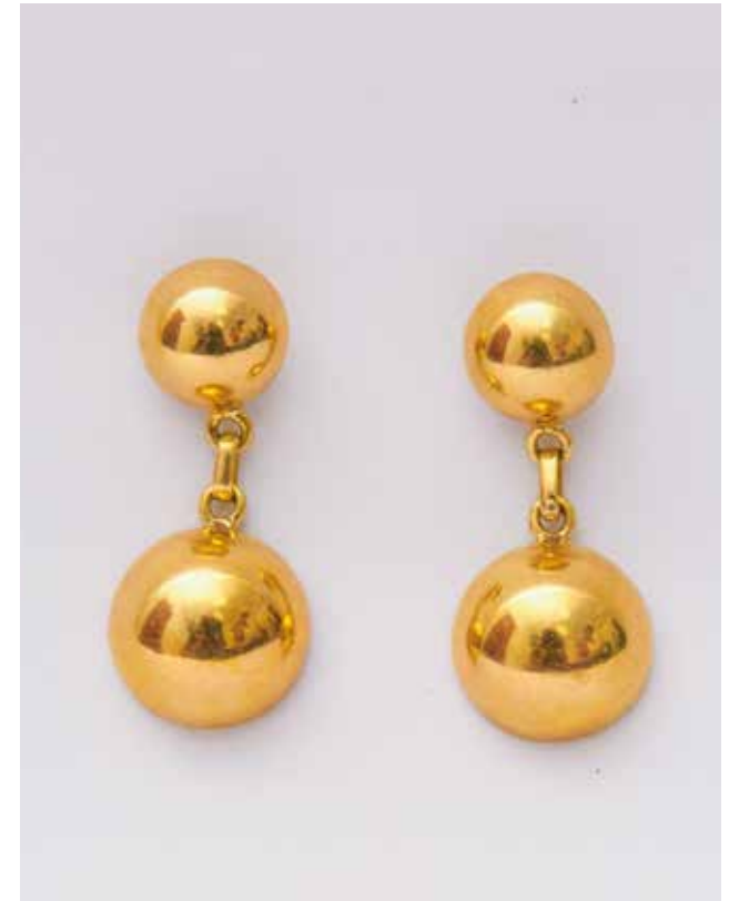
Half Ball Stud Dangling Earring