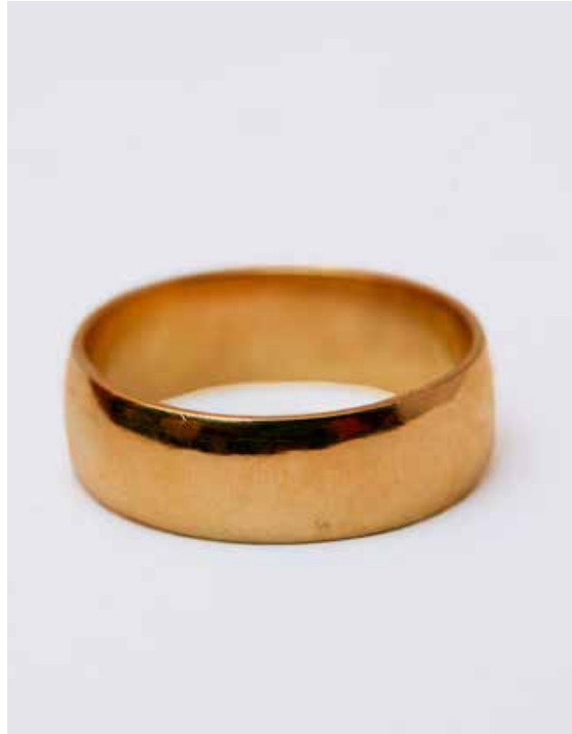
Medium Half Round Wedding Band