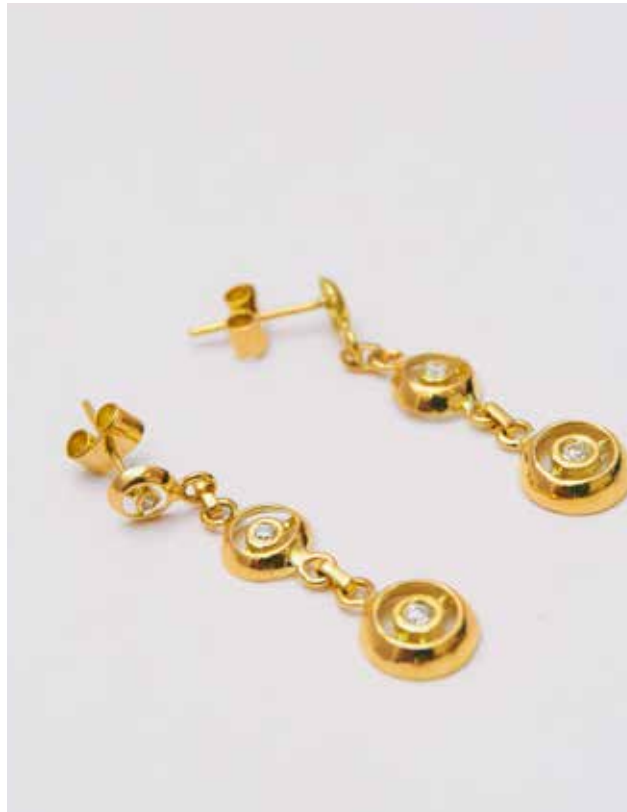
Stud Dangling Earring CZ