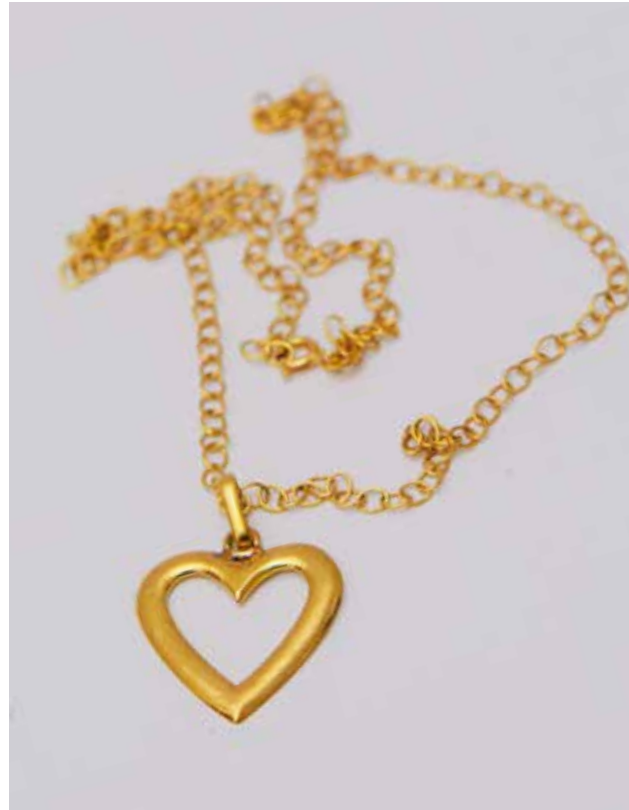
Heart Shaped Pendant