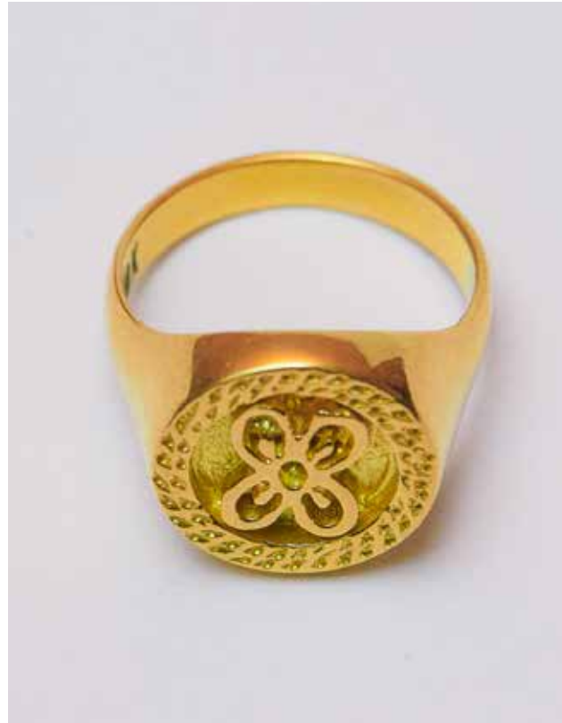
Embossed Bese Sika