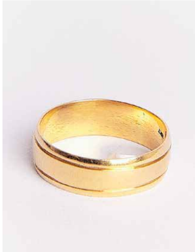
D-Shaped Ring with Edges

Karat: 18 | Weight: 4 grams Price range: Gh¢6,128 - Gh¢8,128