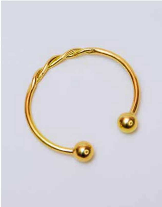
Semi Twisted Bangle