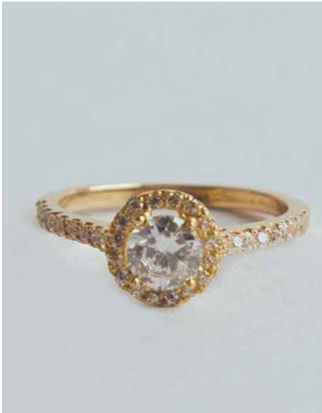
Engagement Ring 3.2 grams