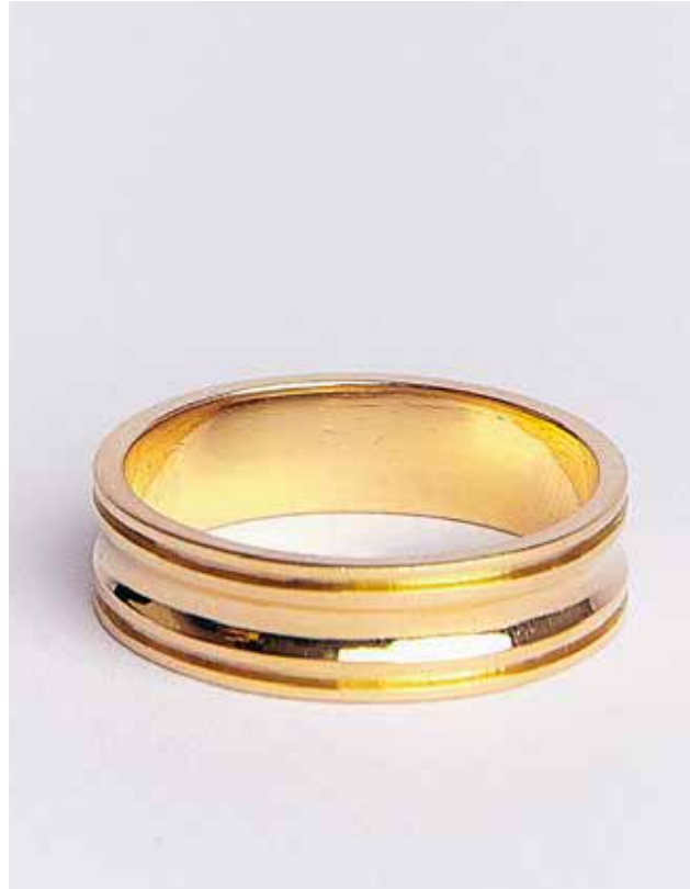
K Groove with Edge