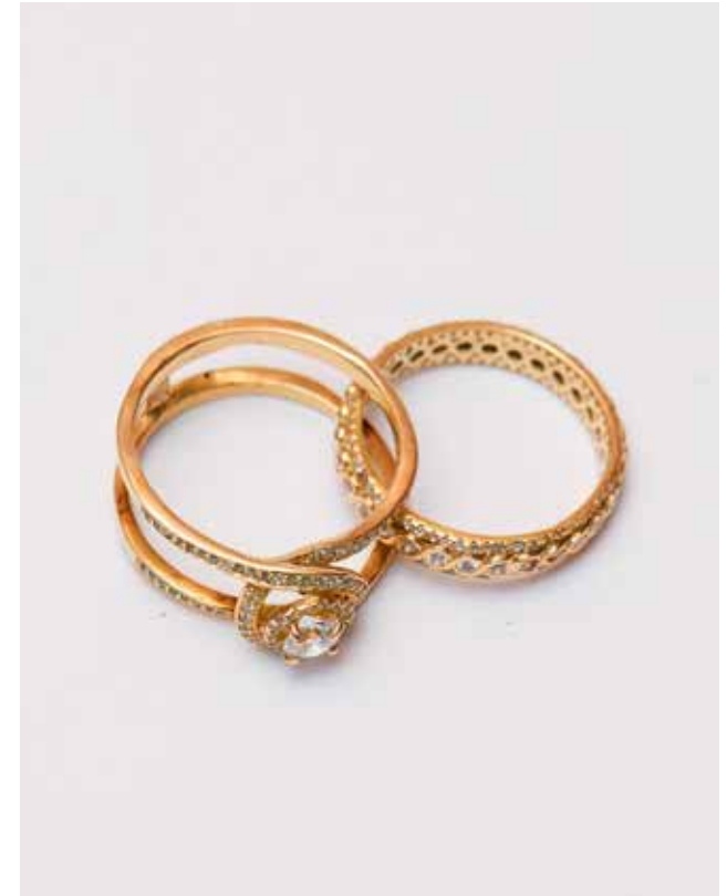
Engagement & Wedding Ring