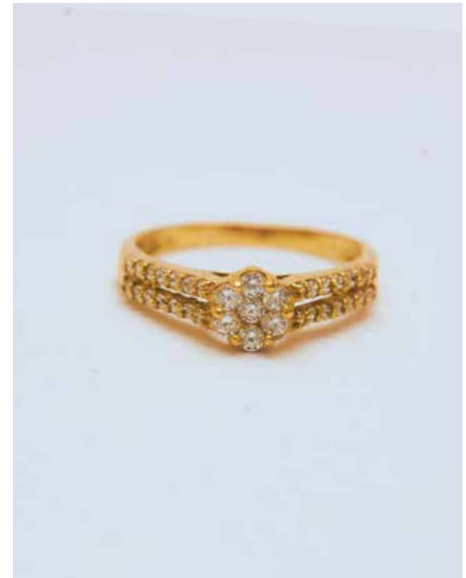
Double Side Round Crown