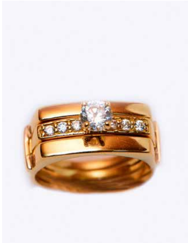
Engagement Ring CZ