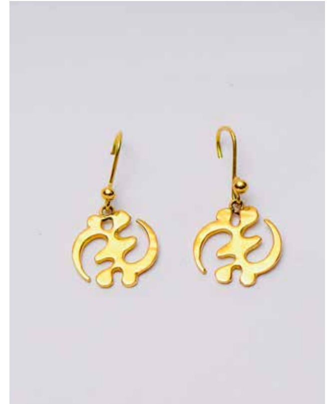
Gye Nyame Hook Dangling Earring