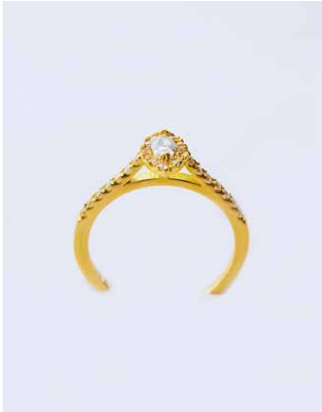
Marquee Engagement Ring CZ