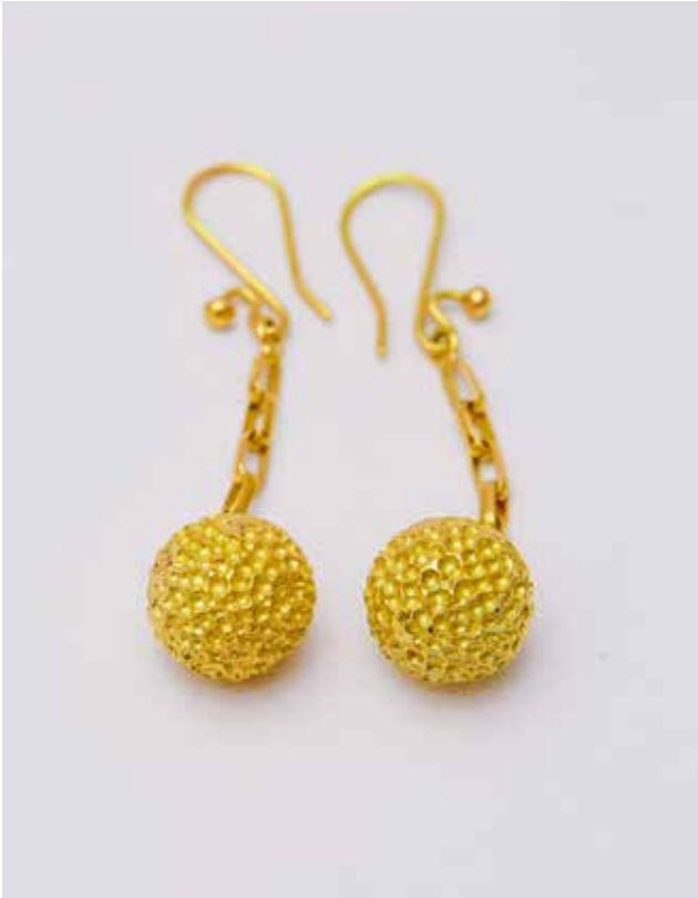
Nugget Effect Ball Hook Dangling Earring