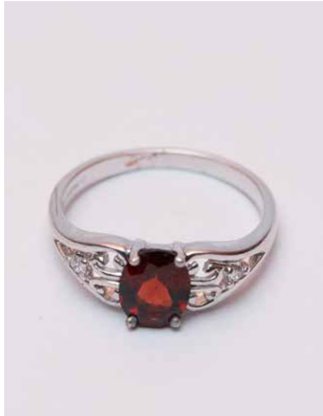
White Gold Engagement Ring