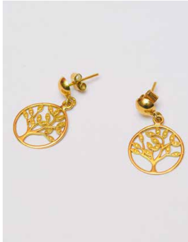
Tree of Life Stud Dangling Earring