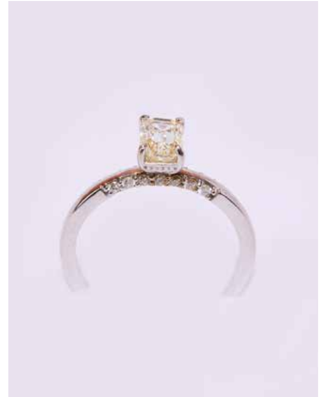
Princess Cut CZ Engagement Ring