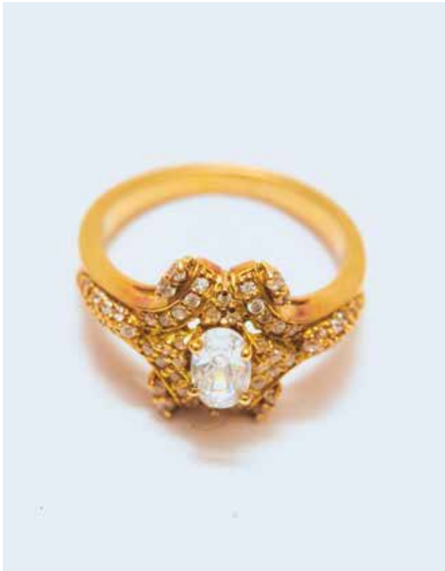
Rams Horn Ring