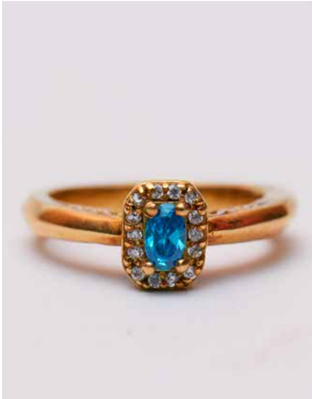
Engagement Ring with Blue CZ