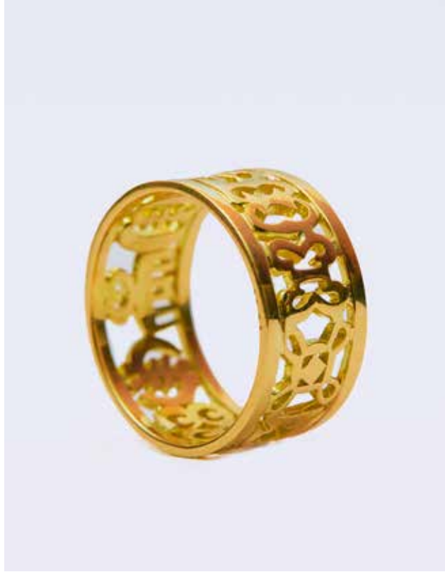
Multiple Adinkra Symbol

Karat: 18 | Weight: 13 grams Price range: Gh¢19,916 - Gh¢21,916