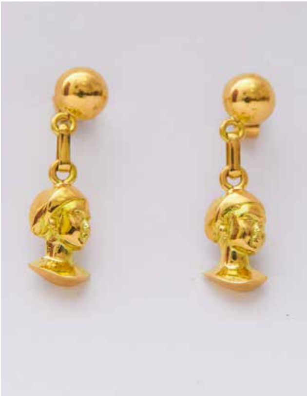
African Woman Stud Dangling Earring