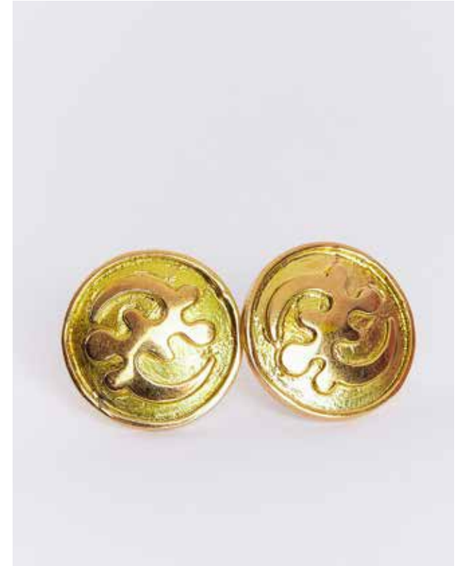
Embossed Gye Nyame