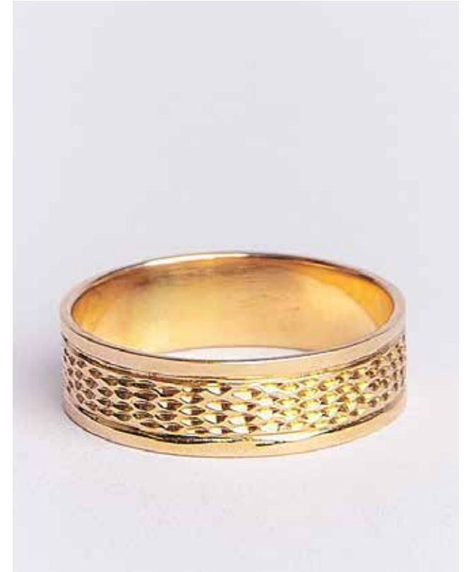
D-Shaped Back of a Tree with Edge