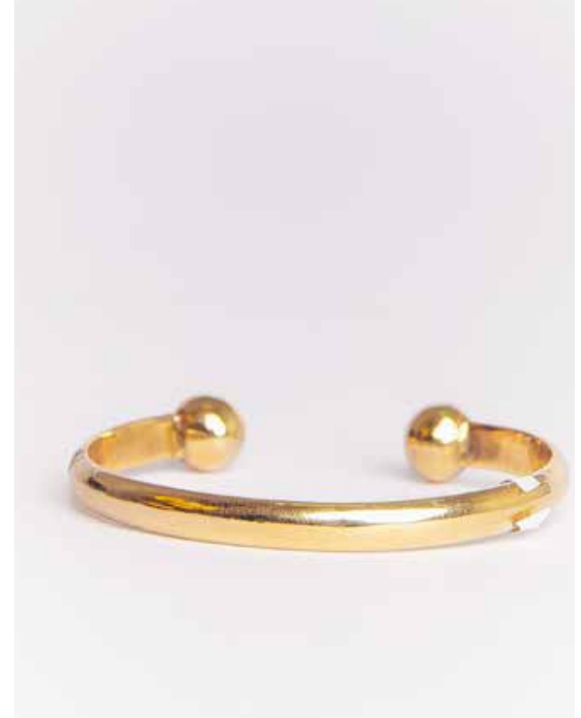
Half Round with Balls