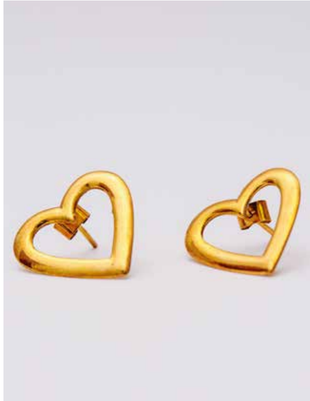
Heart Shaped Stud Dangling Earring