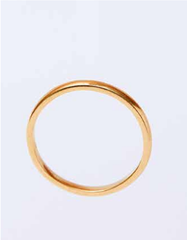
Slim Half Round Wedding Band