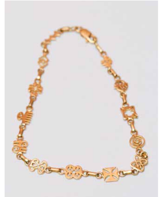
Multiple Adinkra Inspired Bracelet 8 grams